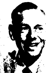
MONTE CLARE Class Measurer