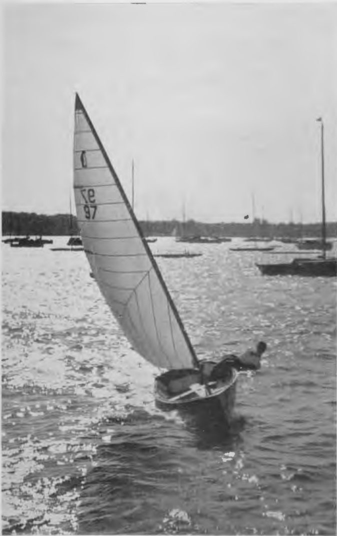
PUCK Winner of 1940 Open Regatta at Alexandria