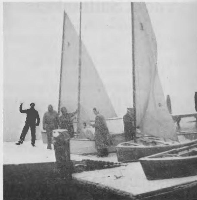
The Penguin Lives up to its Name

3. Boats shall be subject to remeasurement as to dimensions and data on the measurement sheet upon protest. The person protesting shall post a bond of $2.00 as evidence of good faith, which shall be used to pay the measurer if the measurements are in accordance with those on the boat's measurement sheet. If dimensions fail to check with those submitted on the measurement sheet, the bond shall be returned and owner shall pay remeasurement fee which shall not exceed $2.00. Remeasurement shall be made by the measurer of the Yacht Club having control of the races, or a measurer appointed by the Race Committee having control of the races.