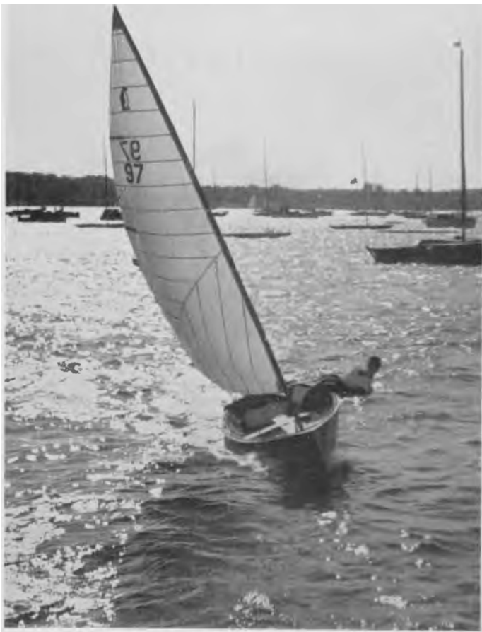
PUCK Winner of 1940 Open Regatta at Alexandria