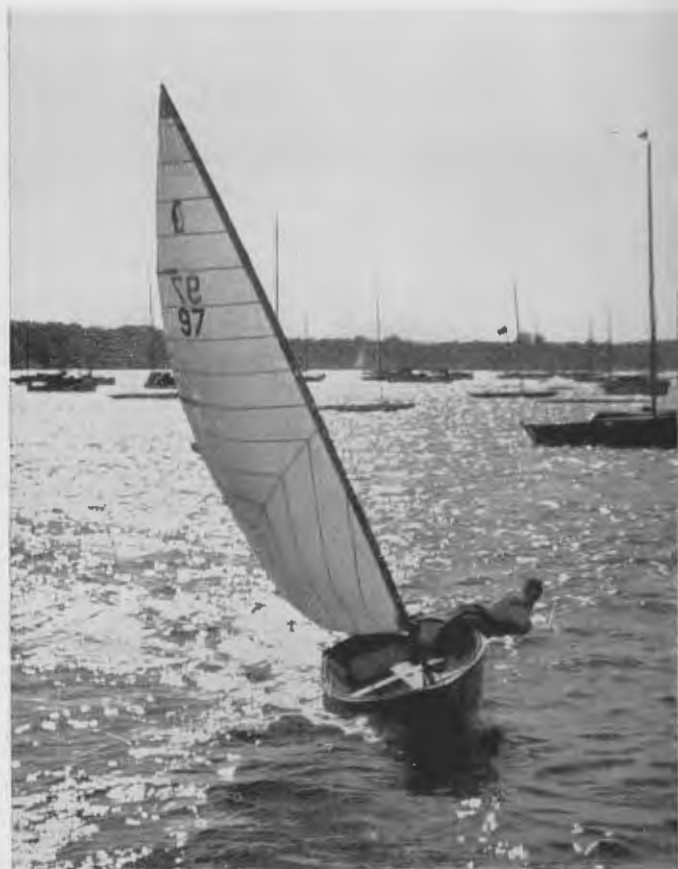
Winner 1940 Open Regatta and Manhasset Bay New Year's Day Regatta