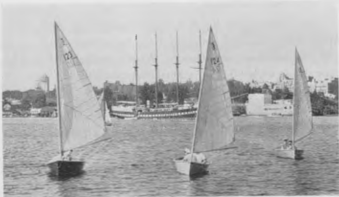
Three of the Seattle Fleet

The Association will refuse to issue a number or grant a measurement certificate to any boat on which the royalty has not been paid or which was not built from a recorded set of Penguin plans. A royalty or number tax of $2.00 must be paid by the builder to the Association on each additional boat built from a set of plans. No boat may properly be sold, or entered in any race as a Penguin, or at any time display the Penguin Emblem upon its sails or otherwise, unless the number tax or royalty on such boat has been paid to the Association by the builder or owner thereof. For the benefit of owners, and prospective owners, the Association proposes to take whatever steps may be necessary to protect the name and Emblem from any unauthorized use.