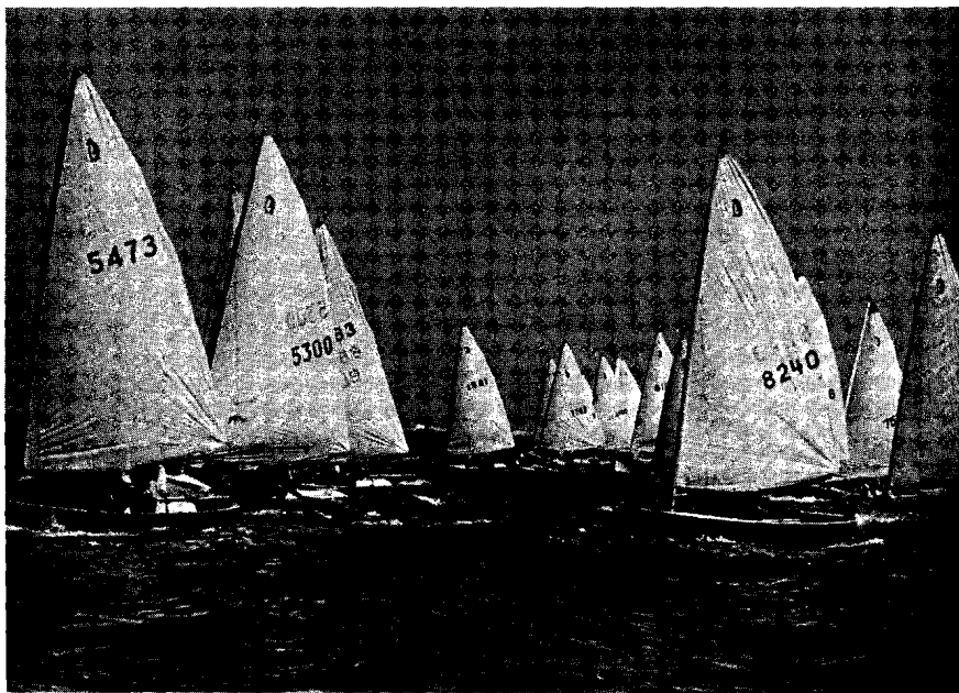
Part of 43-boat senior Penguin fleet bunch up shortly after start of opening race (July 20) on Little Egg Harbor Bay.

(See Pages 19 & 20 for Complete Results)