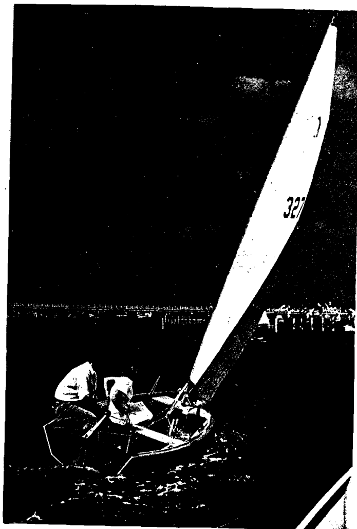
A Close Reach